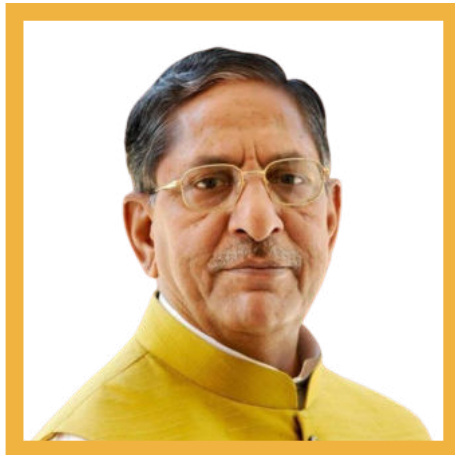
SHRI NAND KISHORE YADAV (Speaker - Vidhan Sabha of Bihar)